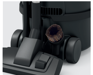
On-board Tool Storage