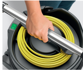
Convenient Carry Handle