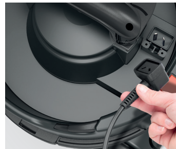
Easy Cable Replacement