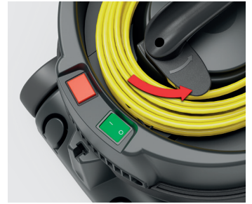
On-board Cable Storage