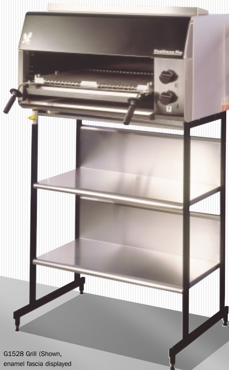
G1528 Grill (Shown, enamel fascia displayed standard fascia is stainless steel, stand is optional)

Vitreous enamel finish with stainless steel exterior.