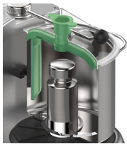
Scraper spatula for cleaning the tank and lid during processing